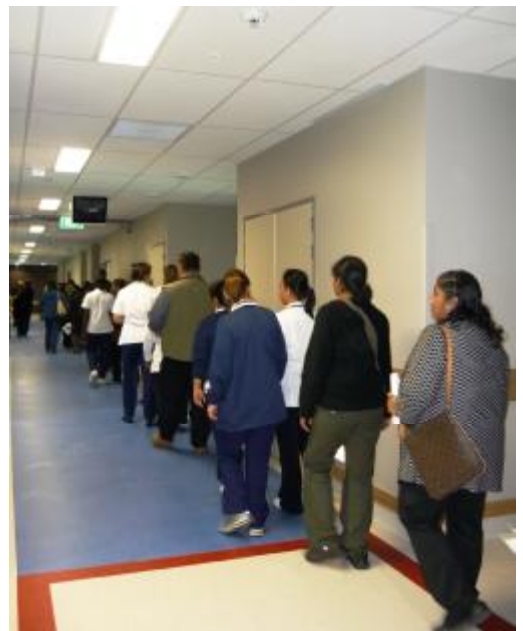
Blessing of Level 4