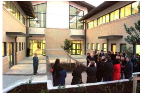
Whitiora (Kaumatua) welcomes staff to the Blessing.

"It also reflects our module as a place of learning and knowledge and where staff can walk alongside the patient in their journey."