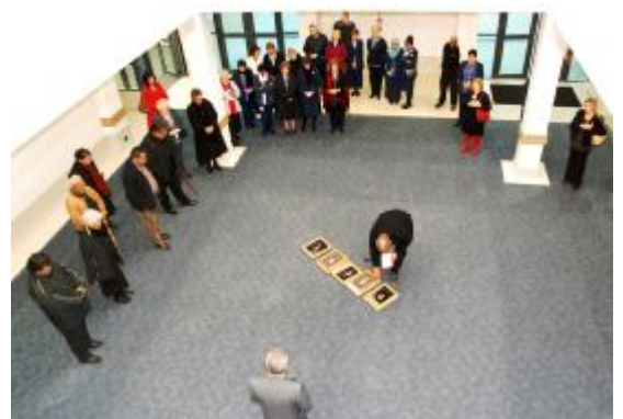
A collection of Maaori artwork is blessed.

Did you know that the Manukau SuperClinic is eleven and a half years old and is still in its original state