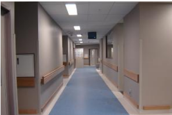
Level 1: CIU