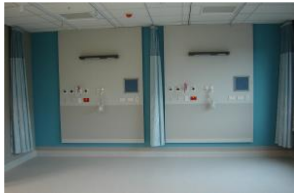
Level 4: Surgical