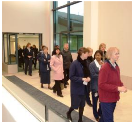
Staff make their way to Module 10 on Level 1