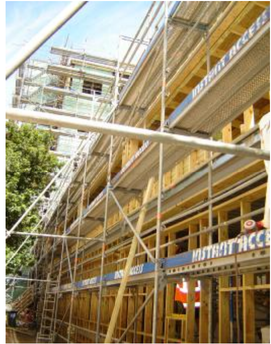
The new link takes shape (January 2010)

will provide ground floor access for the public travelling between the two buildings and level 1 access for patients and staff.