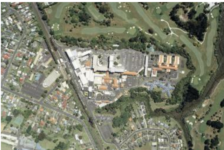
Middlemore Site 2009

The development of the Middlemore Site has come a long way over the years.