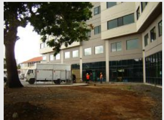
A rehab garden is being planned for the space above

Allied Health equipment such as frames, wheelchairs etc will be assembled, cleaned and stored in the North wing of the basement.