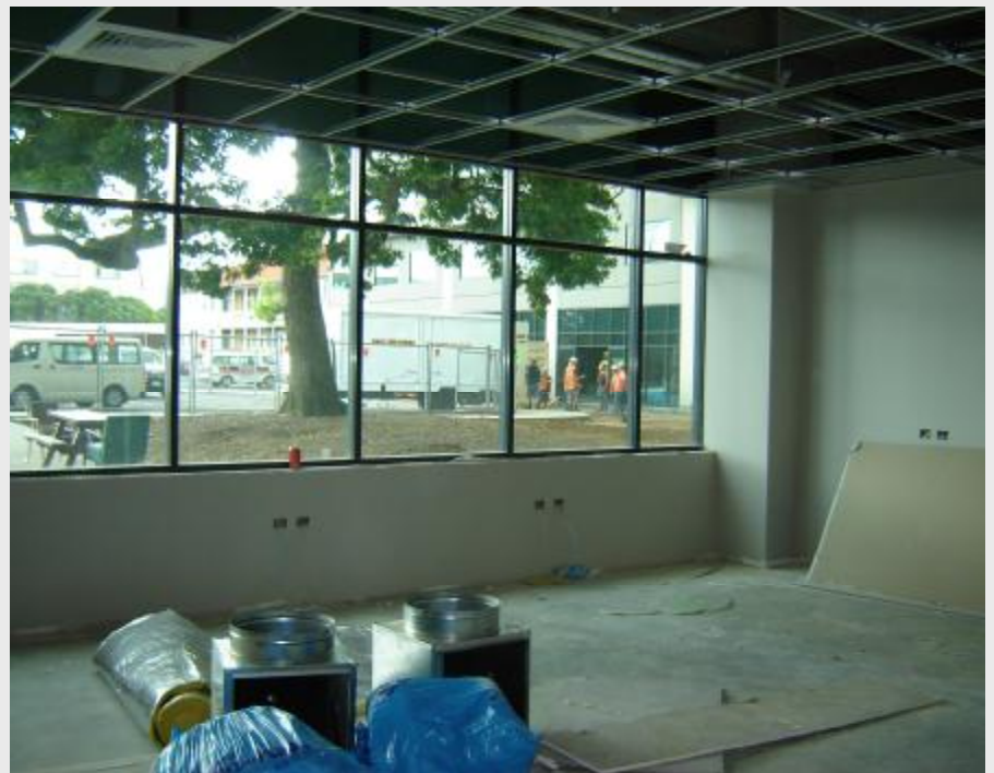
The Discharge Lounge will open mid 2010.

Located on the Ground Floor, the Discharge Lounge will seat up to 15 people and provide a comfortable place to wait until transportation arrives. It's a much nicer environment than waiting on the wards and helps free up beds for inpatients.