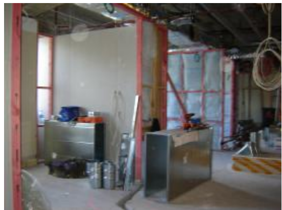
Construction of bed bays - AOU

“Mainzeal are actively keeping noise levels to a minimum and are keeping staff updated on a regular basis.”