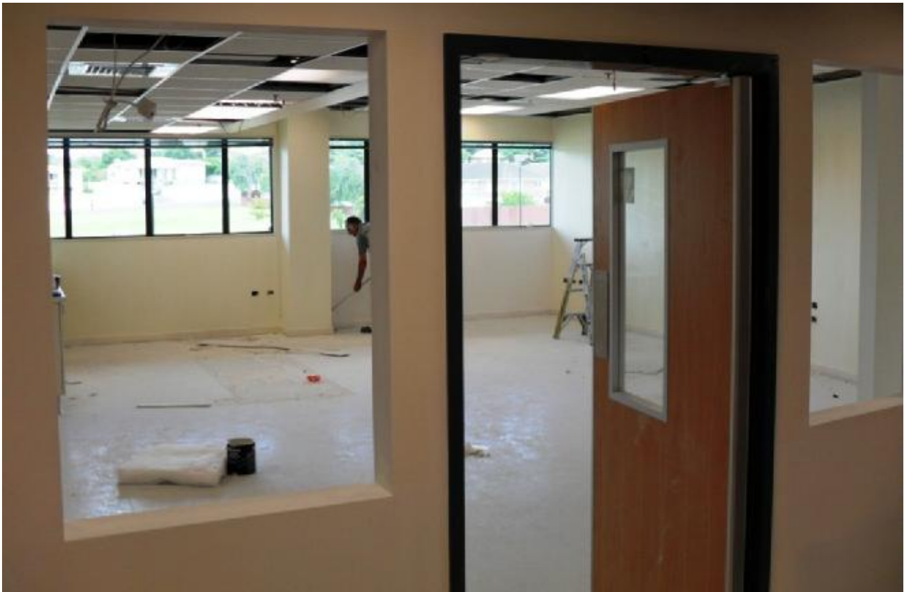
Open plan office area