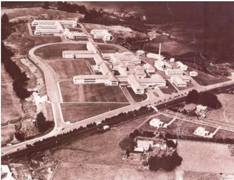
Middlemore Site 1950's

You'll find background information and regular updates on the various projects, along with updated photographs of construction activities, floor plans, copies of Towards 20/20 NEWS and much more.