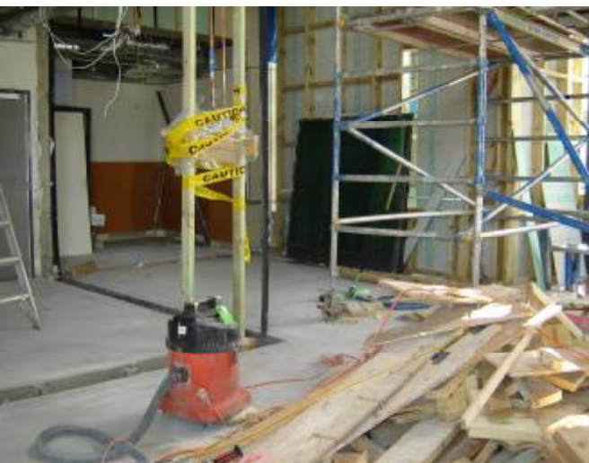
New Lift Lobby – Level 1.

The new link connecting the AMC and Edmund Hillary Buildings will replace the Rainbow Corridor and