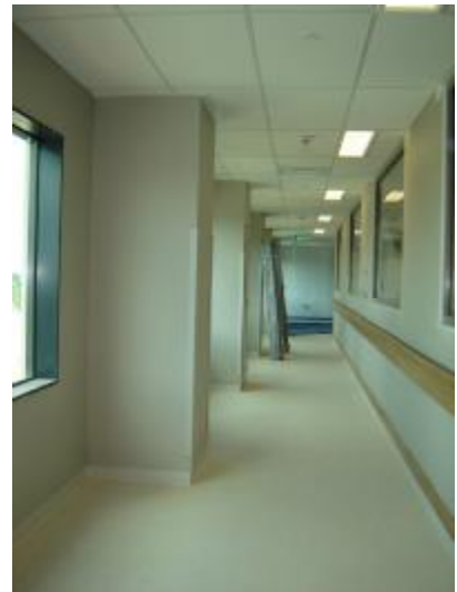
The walking track