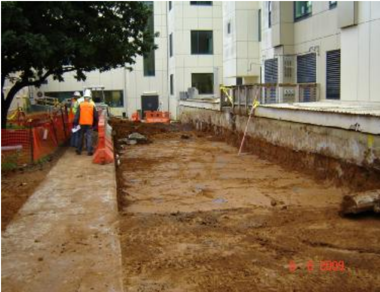
Laying the foundation for the new link (August 2009)

The new AMC patient lifts will provide quick and easy access for staff and patients going to and from the AMC. The new lifts are larger, faster and more reliable than the current patient lifts and will be automated (similar to the Edmund Hillary lifts).